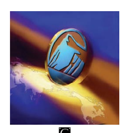
CORNERSTONE A W A R D

Since 1959, Prudential Bunch Company Realtors has been bringing buyers and sellers together with the best of service. We have built a reputation of integrity with creative teamwork, effectively combining our forces of knowledge, experience and flexibility. Today we are ready to provide you with unequaled performance.