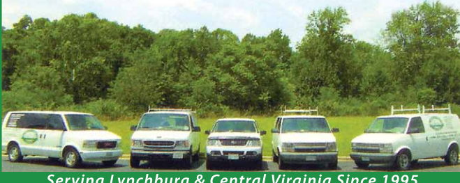
Serving Lynchburg & Central Virginia Since 1995

P.O. Box 11213 • Lynchburg, VA 24506 csspaint@aol.com • www.csschraderpaint.com